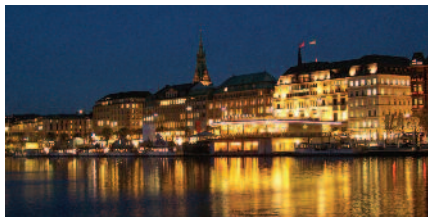
The city of Hamburg at night