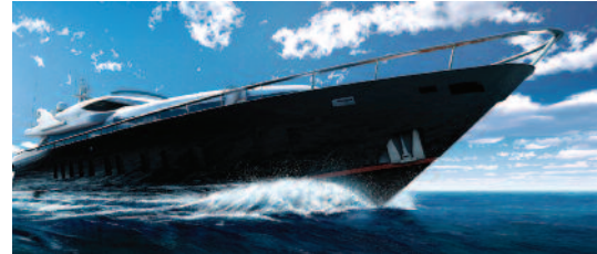
Luxury yacht design created by postgraduate business administration students at SMC University

What makes HEC different, she says, is its passion for evidence-based research. In terms of what she calls rigor versus rele-